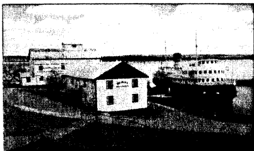
The Township of Assiginack in conjunction with Friends of the Norisle is pressing forward to develop the opportunity of turning the steamship Norisle into a northern-based economic generator.

Manitowaning is home to the S.S. Norisle, the first passenger steamship built in Canada after World War II. Built at the Collingwood Shipyards in 1946, the Norisle provided regular seasonal passenger services from 1947 to 1974 between Tobermory (on the Bruce Peninsula) and South Baymouth (on Manitoulin Island).