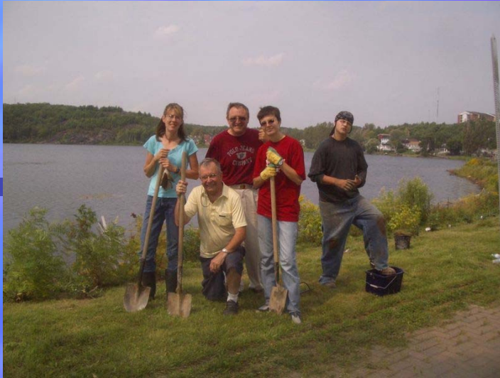
Minnow Lake Crew