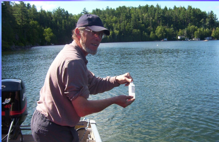
Windy Lake Water Sampling