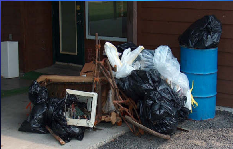
Whitewater Lake Garbage