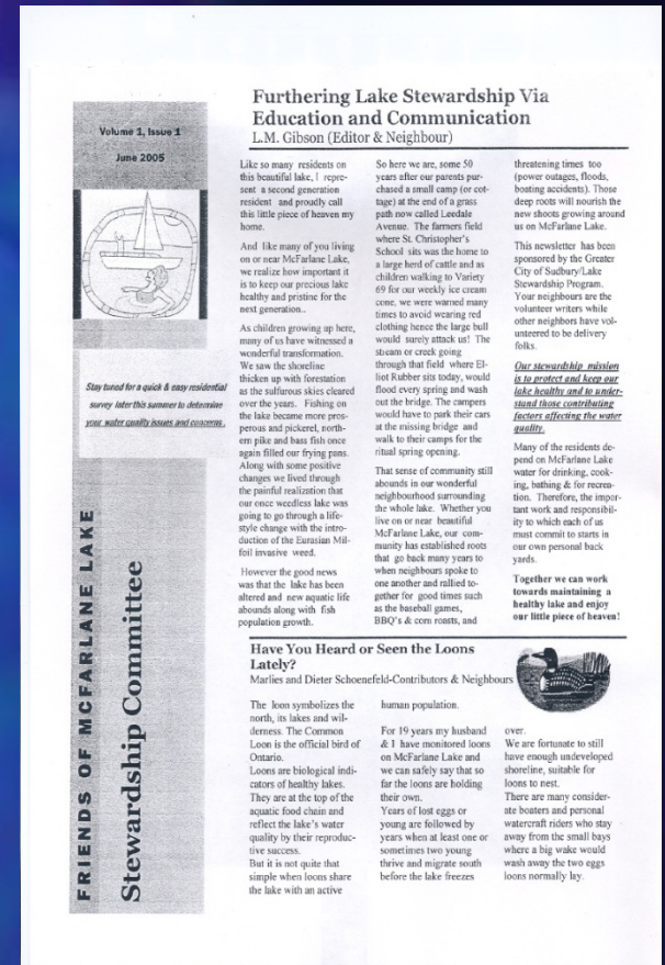
McFarlane Lake Newsletter