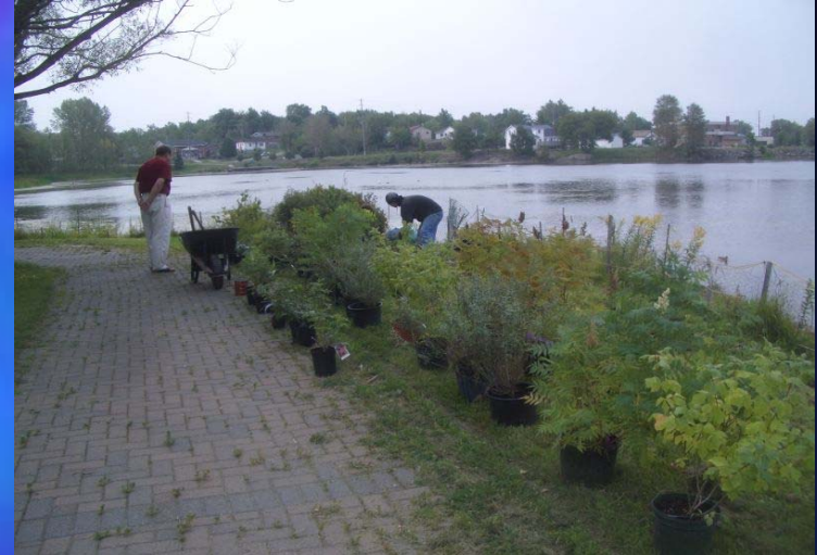
Minnow Lake Shoreline