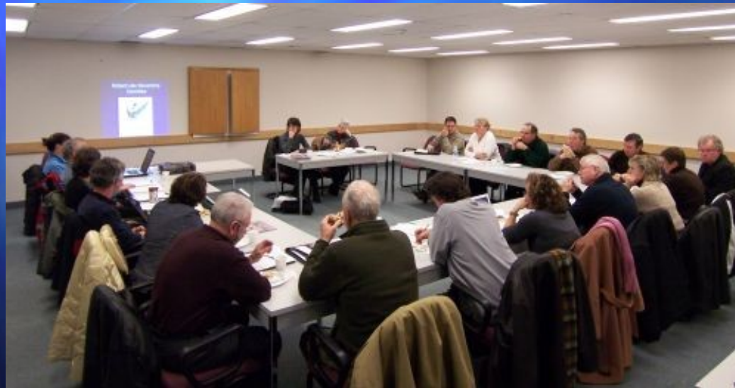
Annual Meeting with Lake Groups